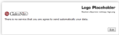
Figure 7: If you have not approve any SP